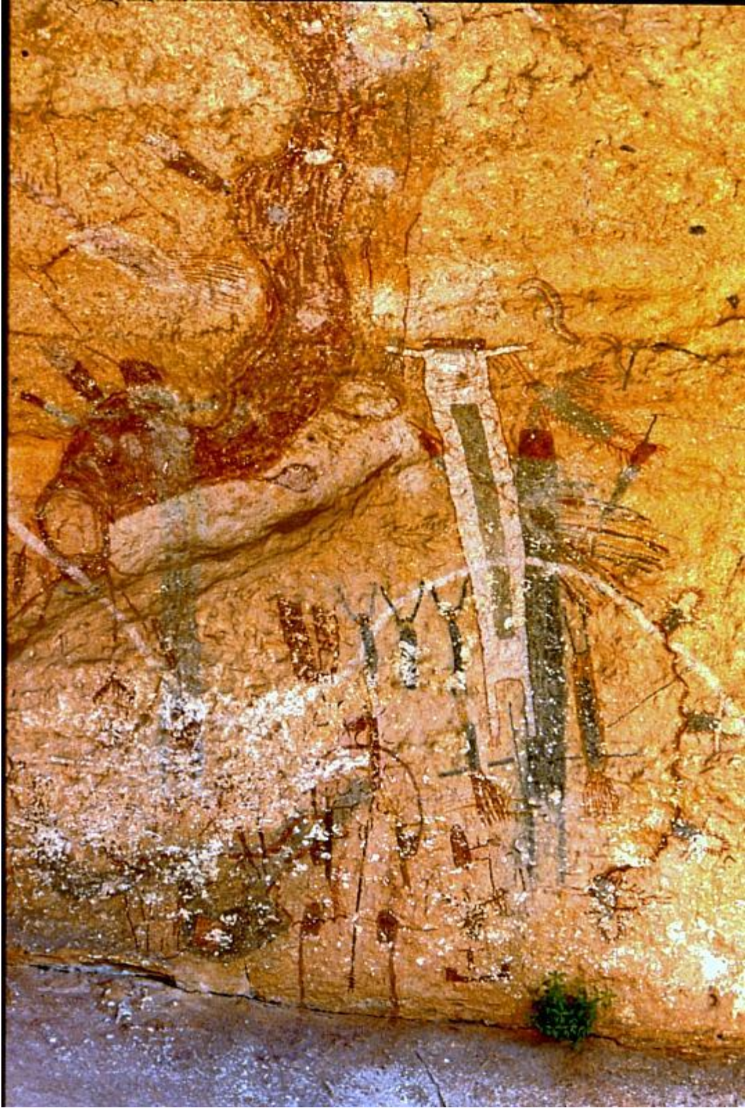
White Shaman Cave, Lower Pecos region, southwest Texas