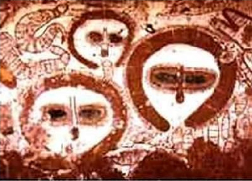
Wandjina Rock Paintings, Kimberley, West Australia