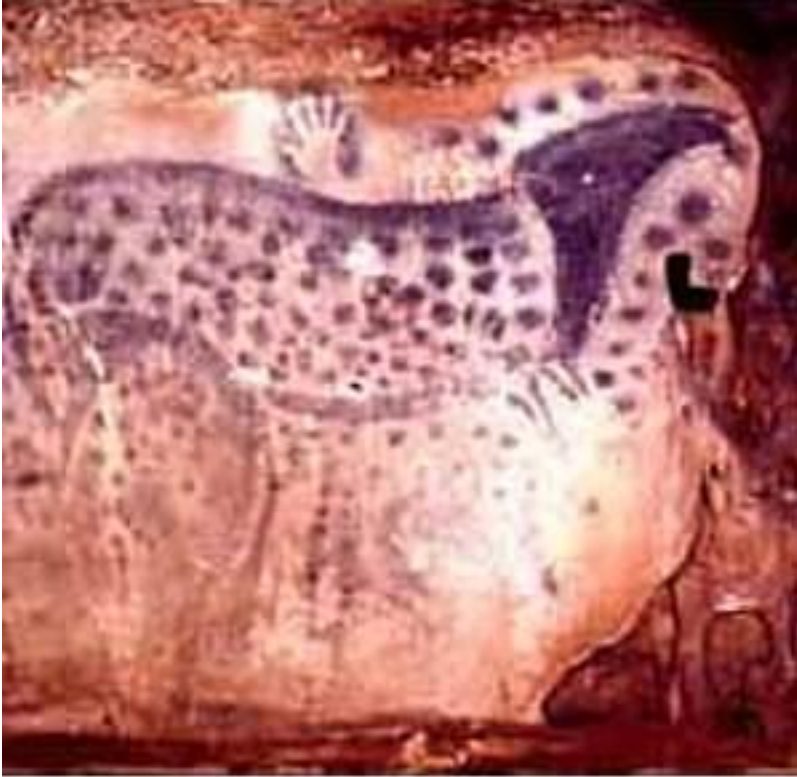
Horse Painting, Peche Merle, France